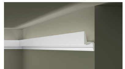
IL7 MEMORY ARSTYL®