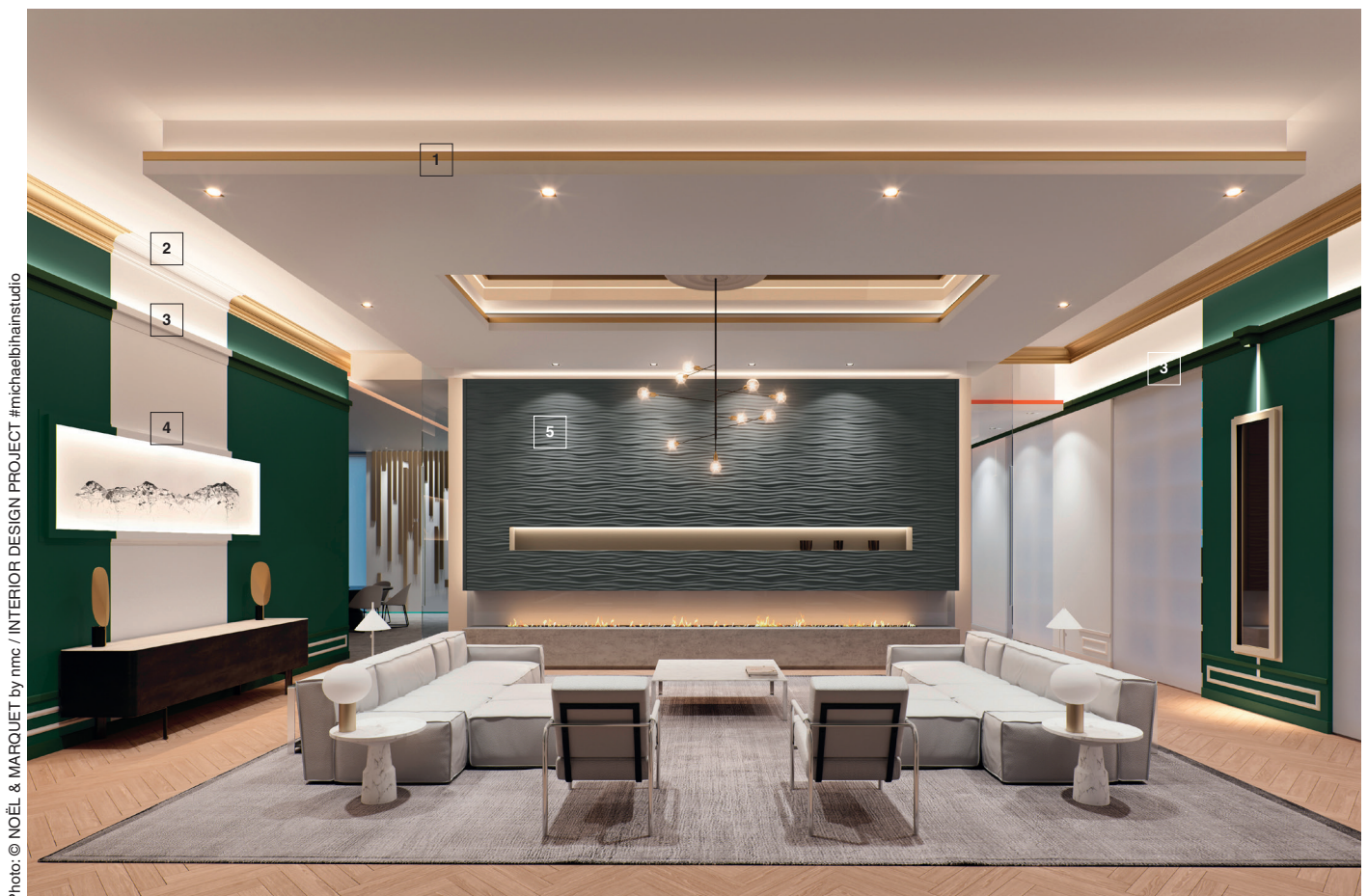
INTERIOR DESIGN PROJECT #michaelhainstudio

1 IL5 | 2 Z40 | 3 IL9 MEMORY | 4 IL6 | 5 LIQUID