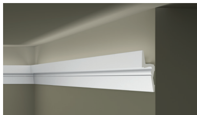
IL9 MEMORY ARSTYL®